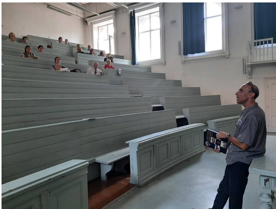
14:20-16:00: Guided walk in the footsteps of Roland Eötvös in the ELTE Building D: Physics Lecture Hall (Balázs Devescovi, ELTE)