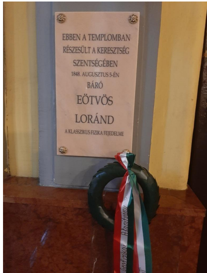
18:00-19:00 Bp. I. Krisztina tér 2. (Roman Catholic Parish Church „Our Lady of the Snow”, Krisztinaváros) The baptism plaque unveiled after the Thanksgiving Mass