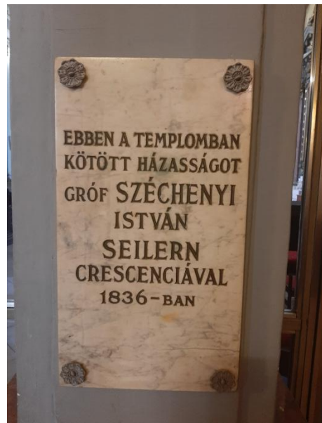
Other plaques in the same church: Széchenyi (1836, wedding) Semmelweis (1857, wedding) and Liszt (1865, conducting the Budai Dalárda)