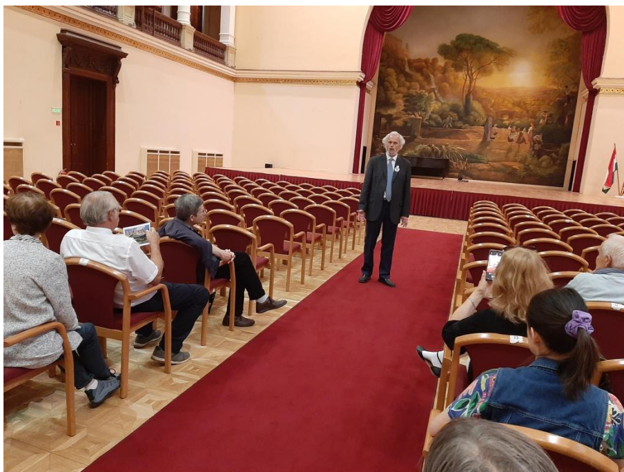
14:00-14:15 Bp. V. Bródy Sándor u. 8. Lecture about Eötvös' activities as Minister of Religion and Cult and as tourist organizer (Domokos Dániel Kis, OSZK)